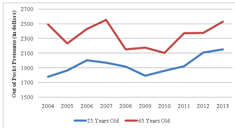
Graph 1: Out of Pocket Premiums by Age 10

Graph 1 illustrates the average out of pocket premiums paid by a 25 year old and a 65 year old. Between 2004 and 2012, there was a 21 percent increase in out of pocket premiums paid by an individual at the age of 25. In comparison, there was only a 1.6 percent increase in out of pocket premiums paid by an individual at the age of 65.