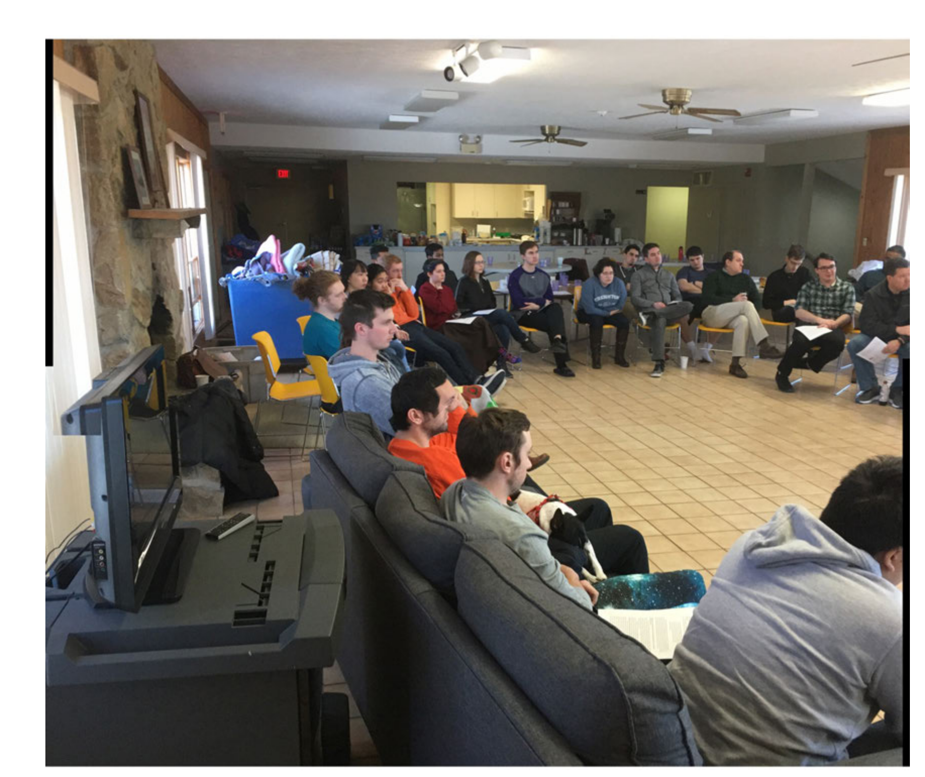
The Physics Department on Retreat in 2019 at Camp Joy Holling