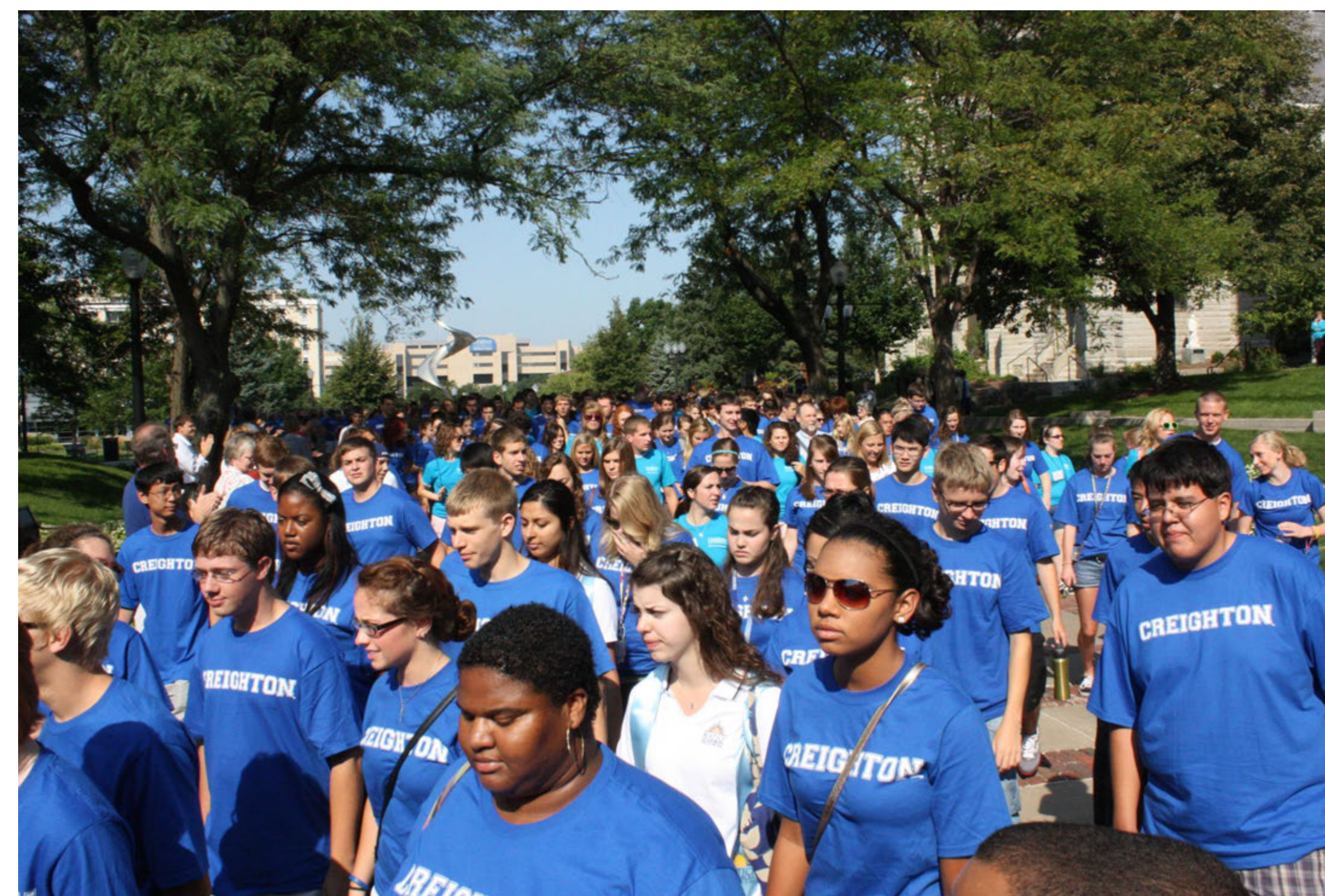
The Creighton Pathway during Welcome Week

Excerpt from the Diversity and Inclusion Policy 1.1.6.