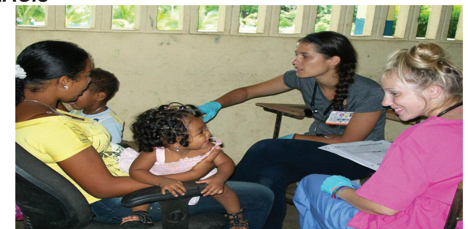
Image 4. In addition to providing the best health care possible to the community, our Jesuit Collaborative group always sought to do better and bring happiness to the communities we served.