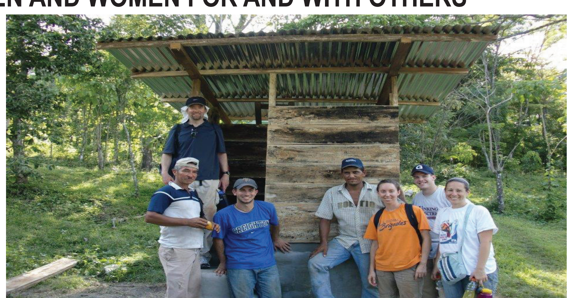
Image 5. One team working on the public health project poses with their family in front of a newly constructed latrine. Each team worked alongside the family every day.