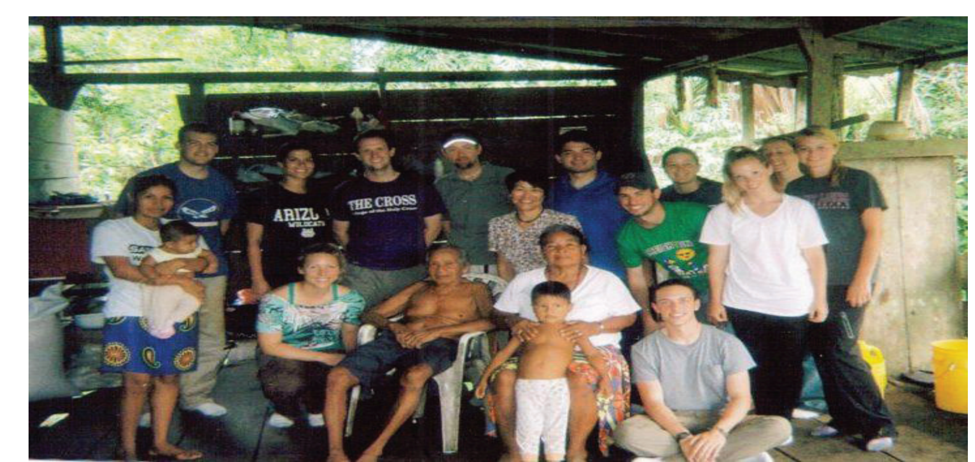
Image 3. Our team had the opportunity to learn about the medical practices of the indigenous Guacuco Kuna people and their thoughts about Western medicine, allowing us to know the entire person before providing care