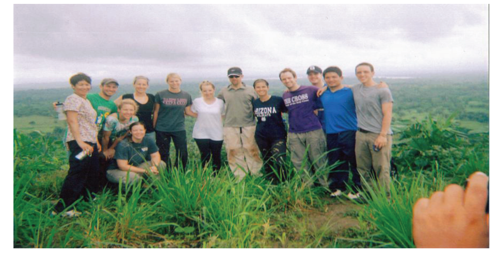
Image 2. Not only did we have the opportunity to see a beautiful new land but also we had the chance to see God in the gracious Panamanian people and in our fellow classmates through daily reflections.