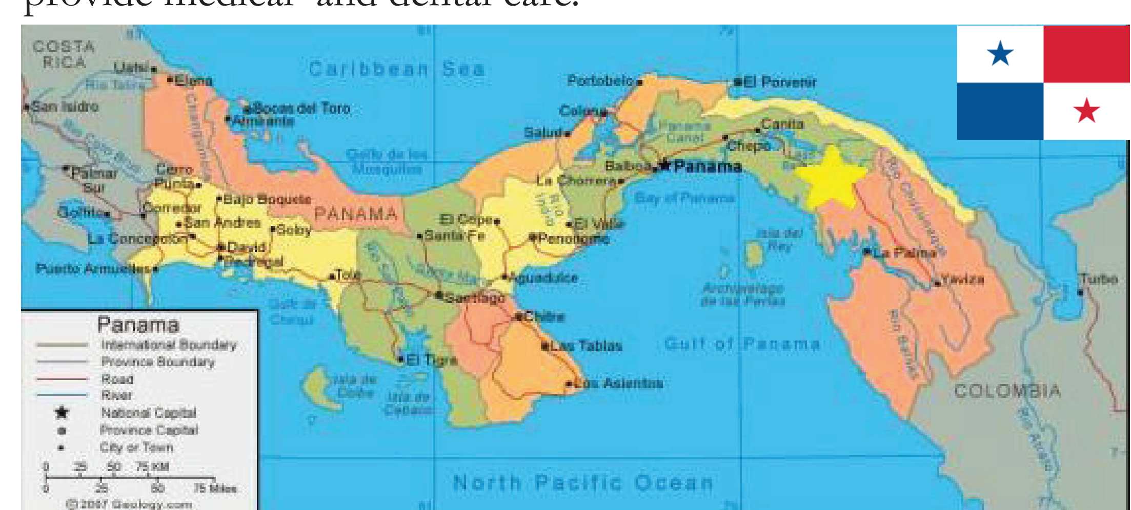
Image 1. Our Jesuit Medical Collaborative Trip was focused in the East Panama region, where we served the rural communities of Guacuco and El Tirao.

El Tirao is a Latino community further south in Panama, closer to the Colombian border. We worked out of a local school to provide medical and dental care.