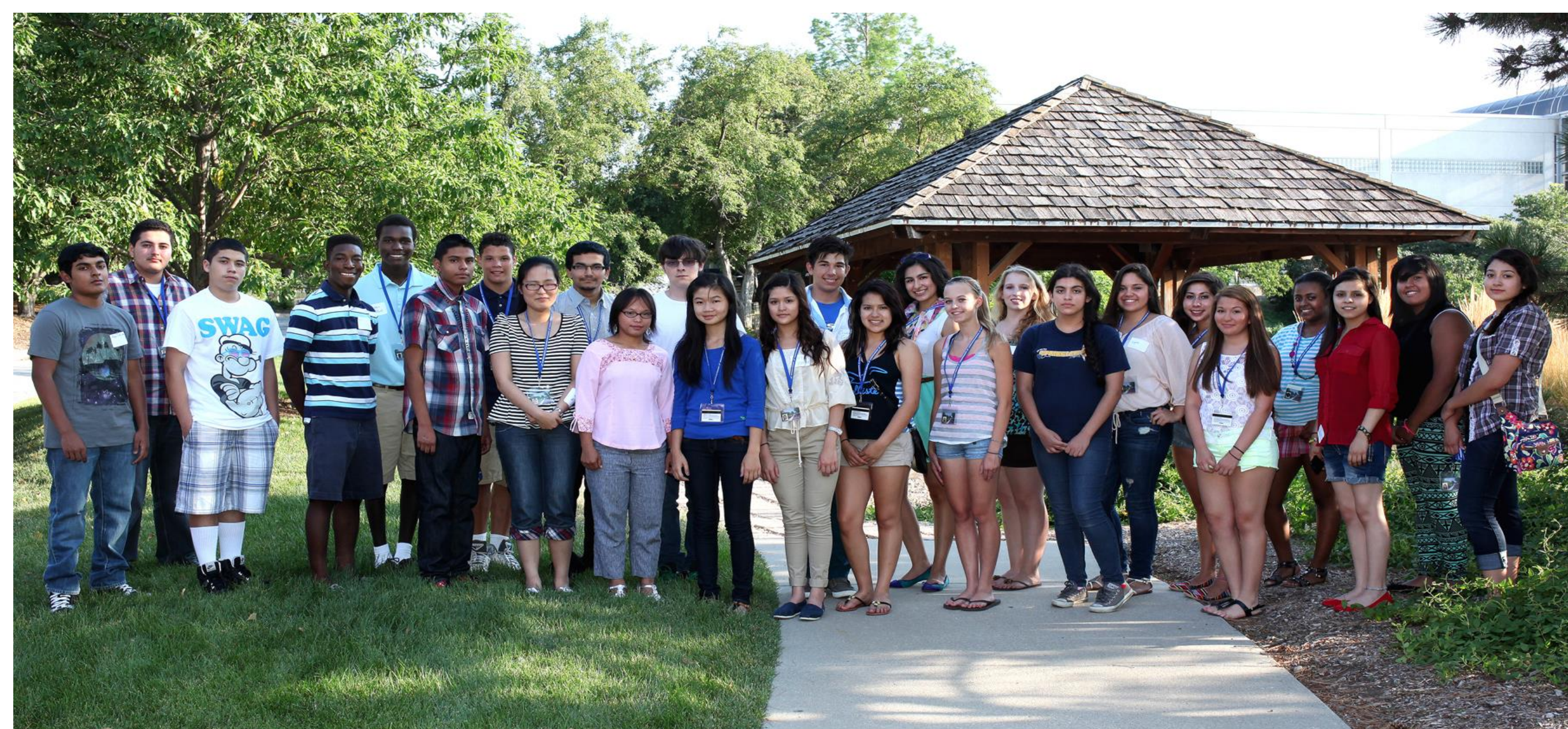
First ICC cohort orientation, July 12, 2013

As a Jesuit Catholic institution, we are charged with the task of finding out how to best engage, enroll, educate, and graduate students from groups historically underrepresented in higher education: African Americans, Asian Americans, Latinos/Hispanics, Native American/Alaska Native, and those from socioeconomically disadvantaged backgrounds. In order to facilitate greater enrollment in higher education, and increase their representation and graduation rates, annually two ICC participants will be eligible for full-tuition scholarships to Creighton University and will receive additional support once they matriculate at Creighton.