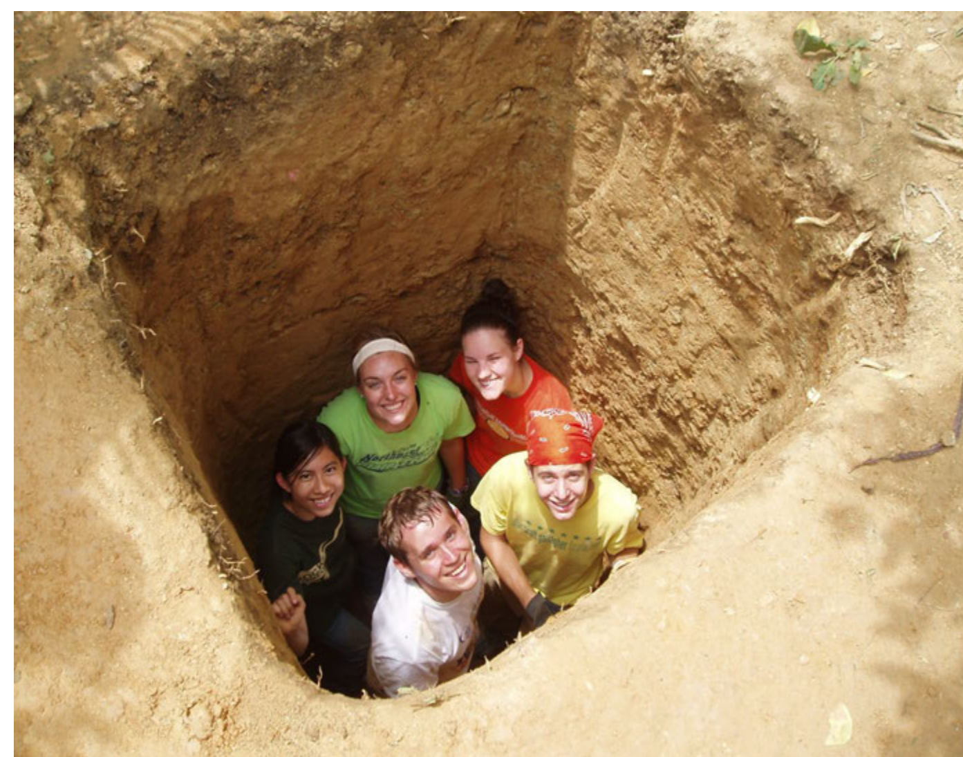
Participants standing in a hole that they just finished digging. This hole will be used for a newly constructed latrine for a family. The latrine will provide a central location for human waste, benefiting the health of the family and entire community.