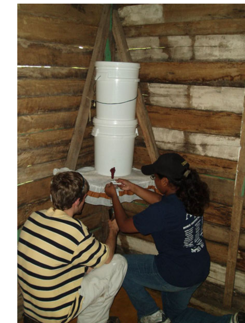
Left: Participants taking a sample from a filter inside a Dominican home. The sample was later taken back to the lab at the ILAC center and processed. The results were then shared with the community so necessary improvements could be made.