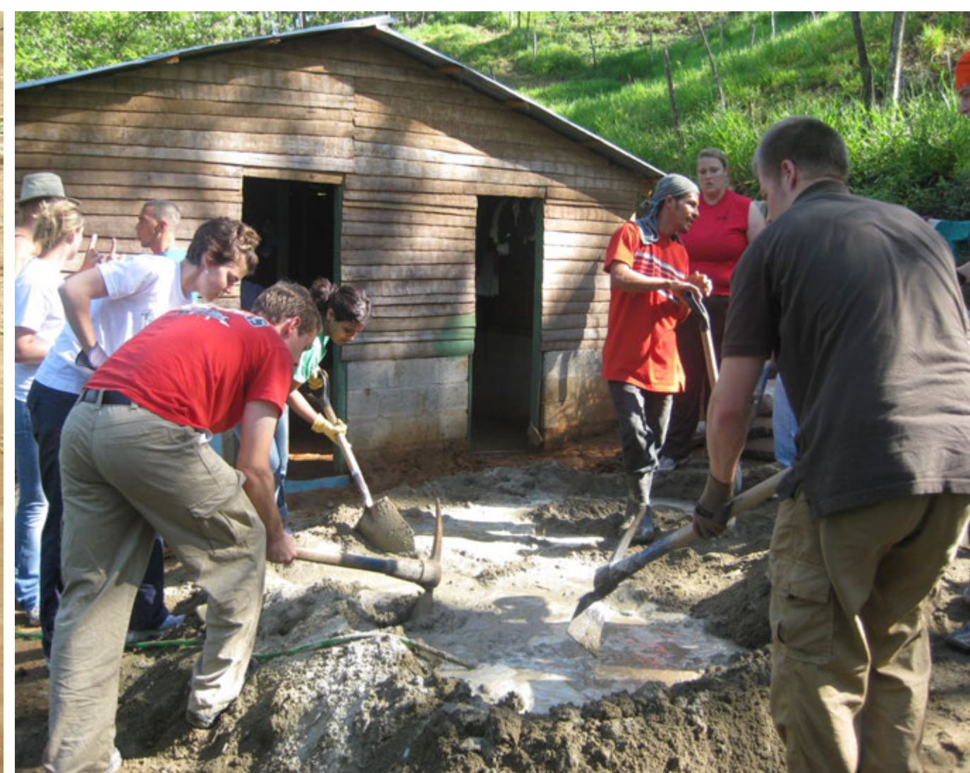
Participants laying concrete that will replace a dirt floor in a family's home. This provides the family with a sanitary and permanent living space and the opportunity for a more healthy lifestyle.