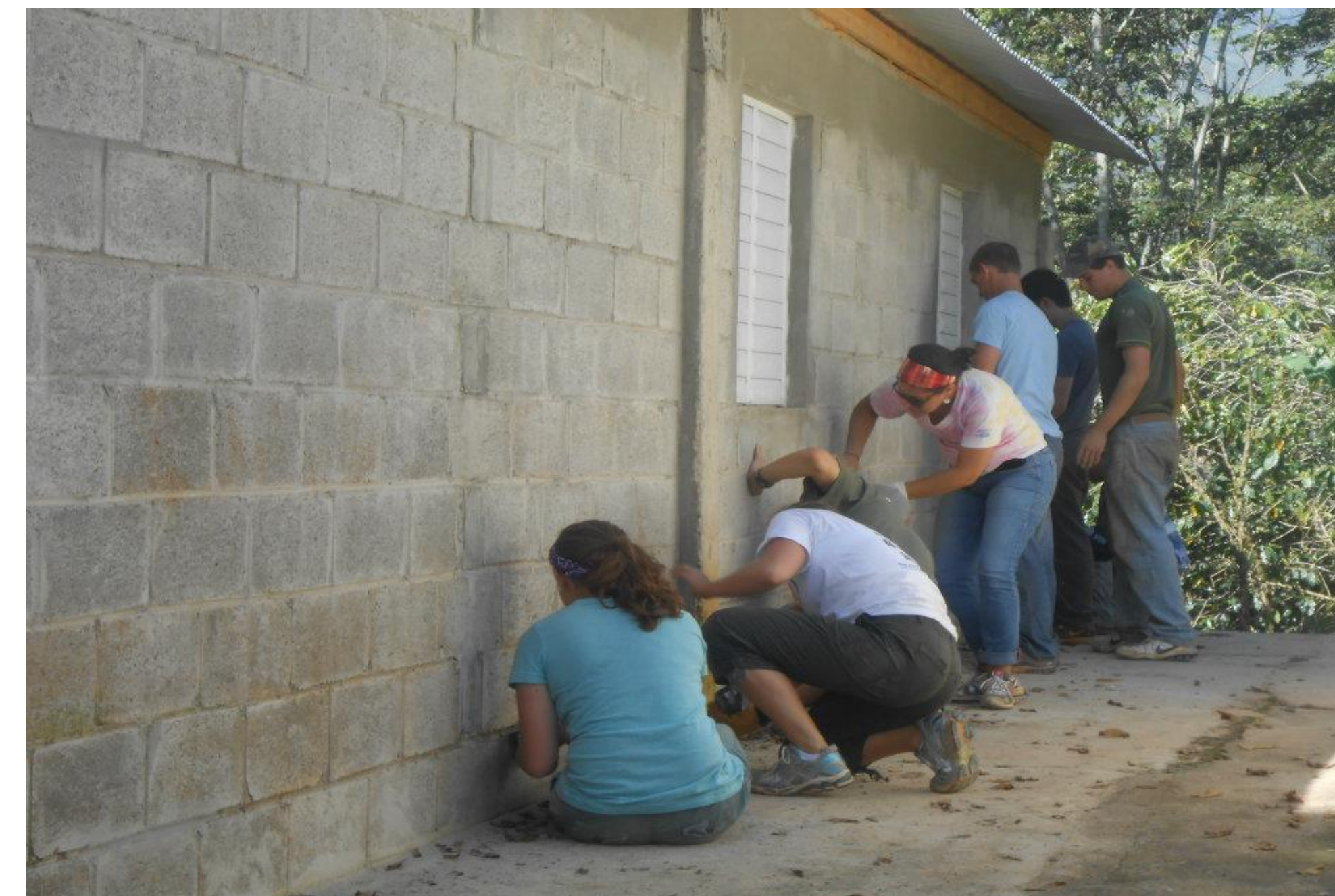
Participants work to sand the outer wall of a new community clinic in the campo of Las Lagunas. The closest clinic, other than this facility, is hours away. This clinic is now fully functional and serves as a health resource for the community.