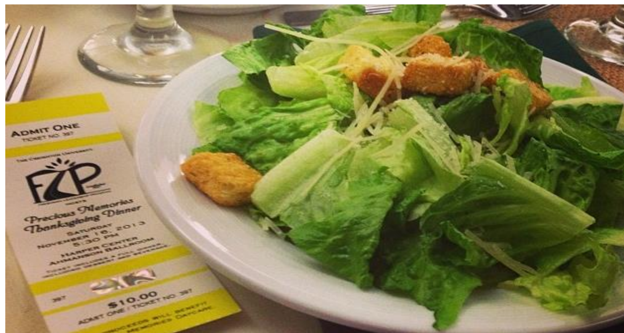
First course and ticket from the 2013 FLP Thanksgiving Dinner Sponsored by the Creighton University Jesuit Community, in association with the Deglman Center for Ignatian Spirituality.

Everything presented and experienced in FLP would mean nothing if such were not personal. As a requirement from the program, the freshmen complete a portfolio project come the end of each academic school year. The portfolio lives up to its name: it is each student's reflection, growth, realizations, and potentials bundled into a single, tangible space. Completion of the portfolio not only symbolizes completion of FLP, but it is a resource for each member to take and to use throughout the rest of their Creighton experience and beyond. The portfolio allows FLP, and all its memories, to last and resonate within each person beyond the scope of the program itself. In addition to compiling one's own portfolio, each freshman presents his or her portfolio to other freshmen, allowing for both self-growth and communal growth. Through the completion of this project, freshmen not only realize just how much the past year has impacted them, they realize just how powerful and how special of leaders they truly are.