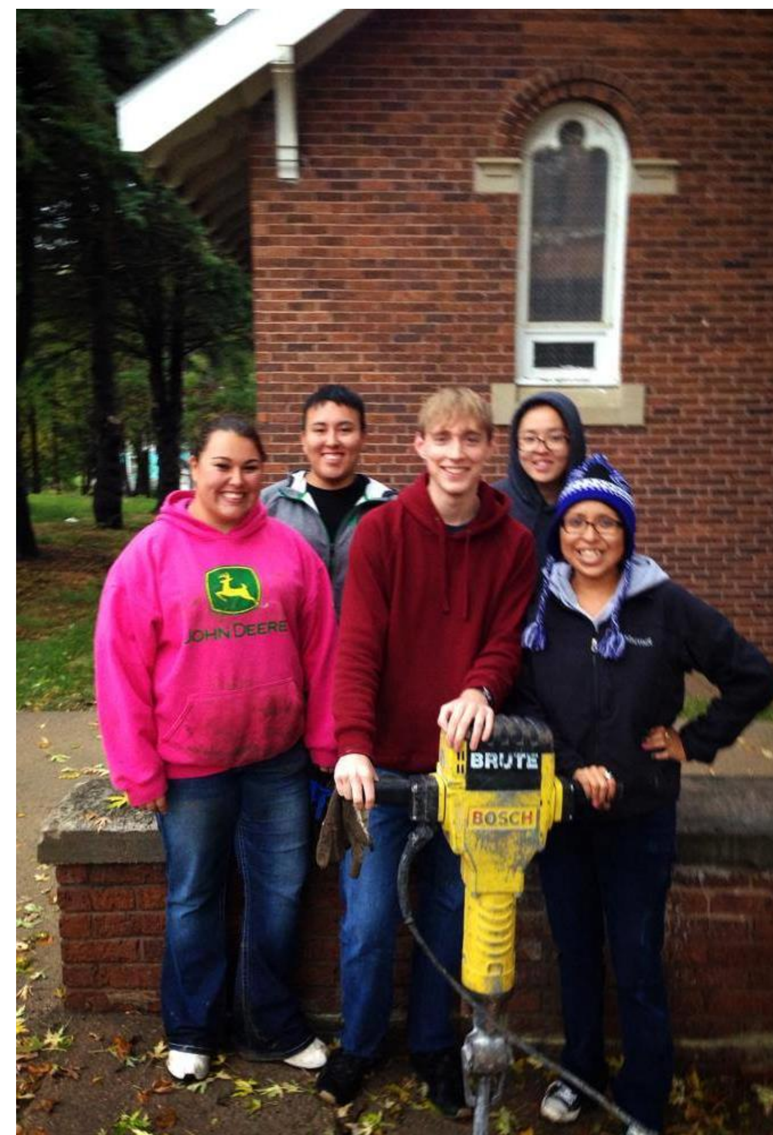
Winnebago Immersion participants helping St. John's Church in Walthill, NE.