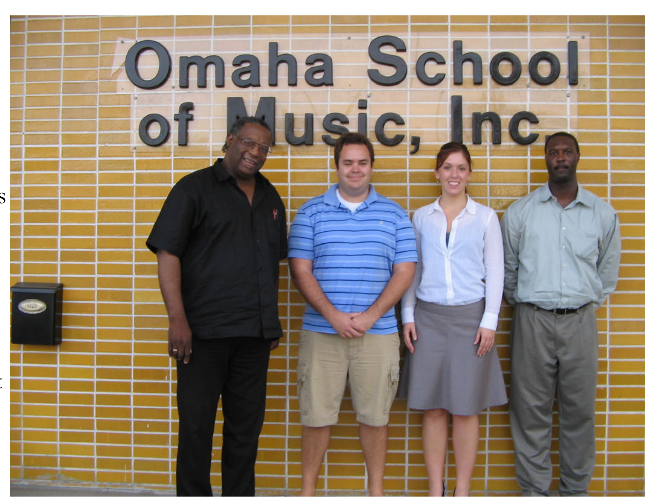
Students help a Music School better track Receivables. Added revenue is used to provide music scholarships to those in need.