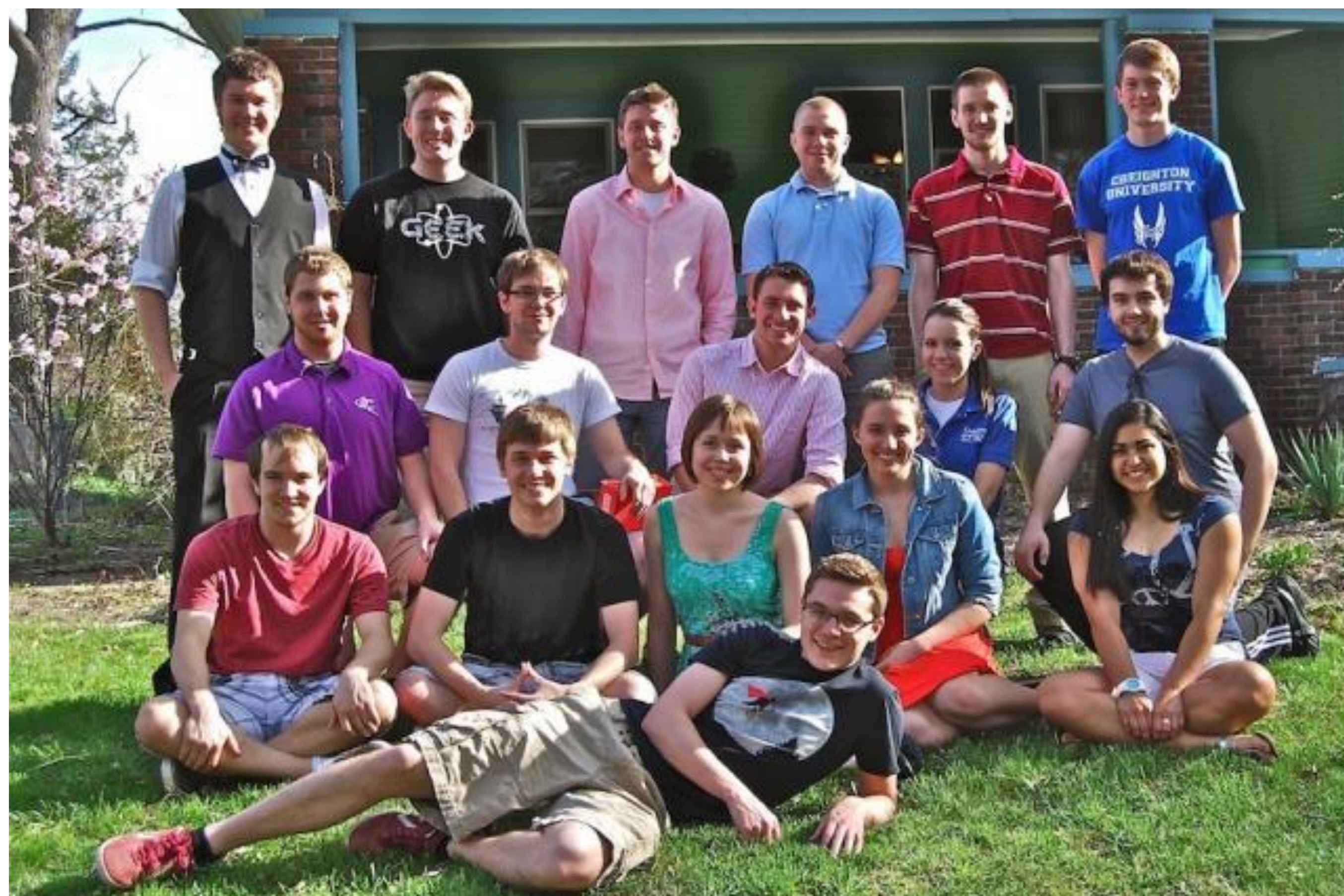
Physics Majors, 2012-2013

and the theme for the 2014 Department Retreat is “What is Progress?”