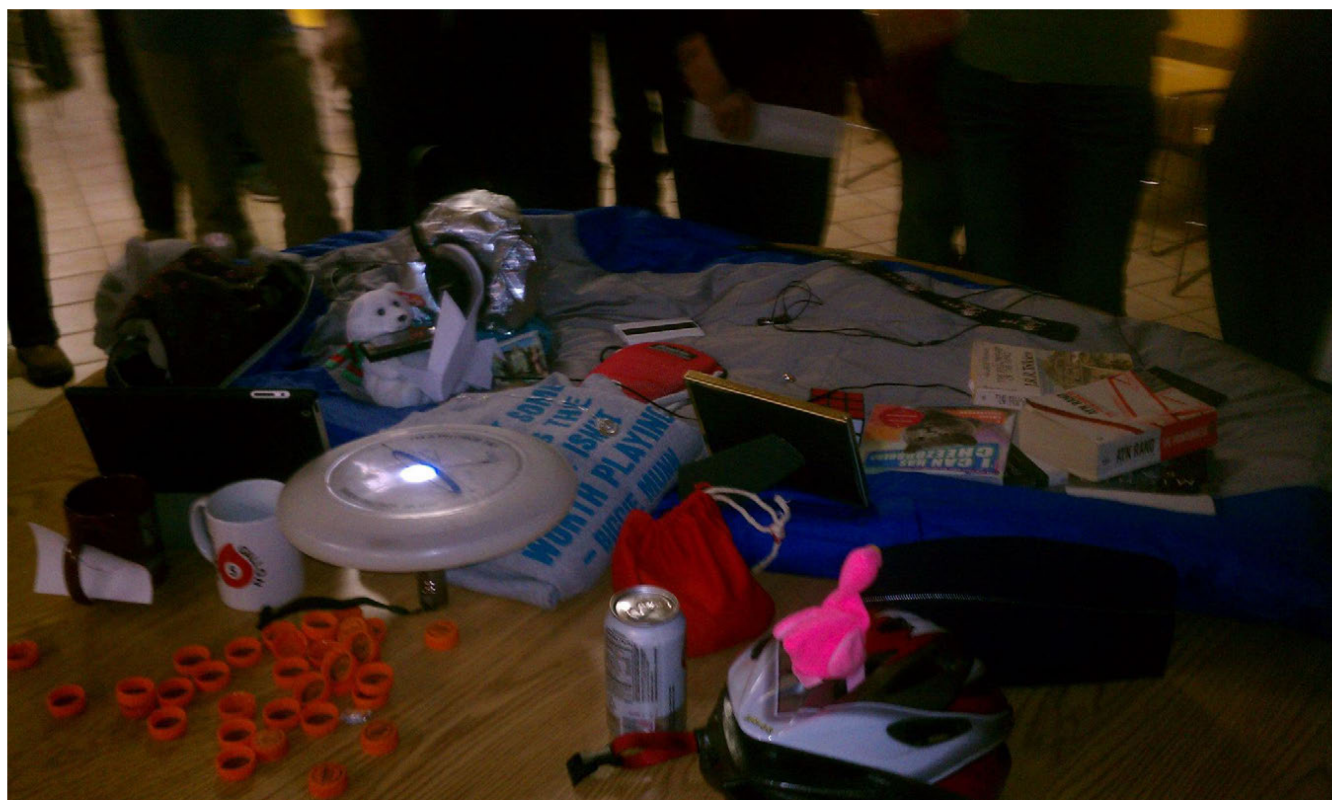
Physics students and faculty brought items that symbolize some aspect of their life.