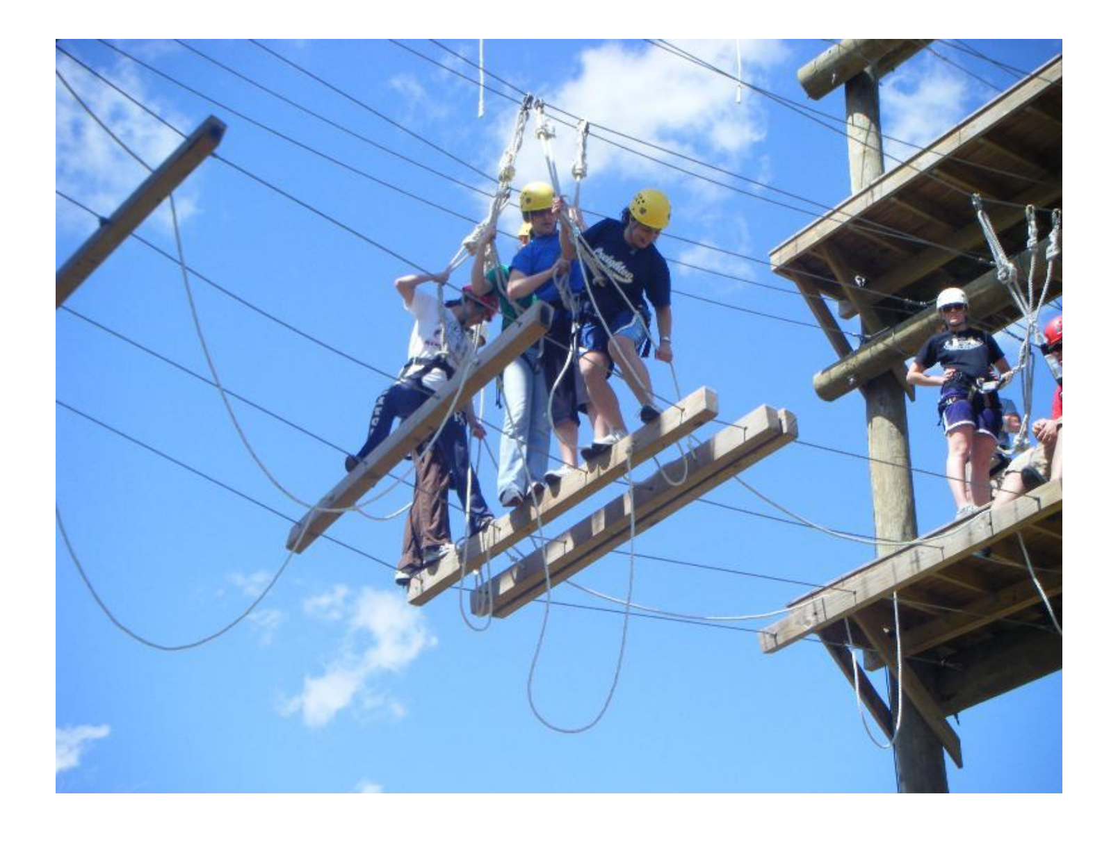
Pharmacy Class of 2011 P3 Retreat

When the Pharmacy Faculty began updating the educational outcomes for pharmacy graduates, the Ignatian Values were recognized as an important component of a Creighton Education. It was decided to explicitly include the Ignatian Values in Welcome Week, Professional Development Seminar (6 semester sequence) and Class Retreats.