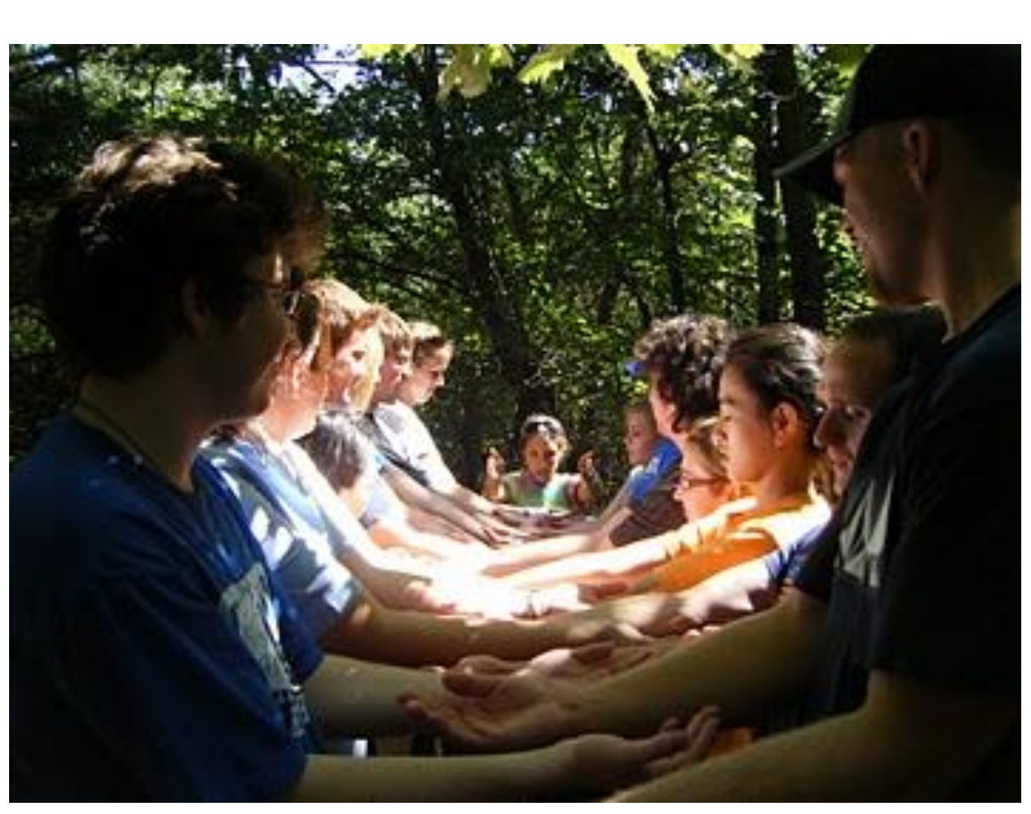
Pharmacy Class of 2014 P1 Retreat