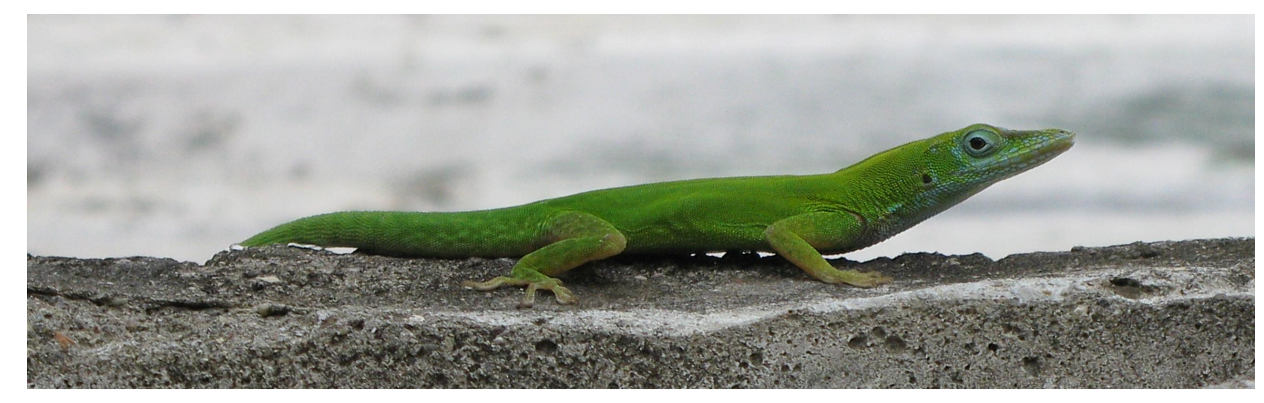
Gecko at the ILAC Center

Encuentro Dominicano is an intensive living and learning semester-long program, which combines classroom study with real world experience. Its purpose is to expose students to the realities of life in a developing country through direct cultural interaction. True immersion in the culture requires giving of yourself, stretching your boundaries, speaking the language, and having fun at the same time. This is an amazing opportunity to learn outside of the classroom and to have a different lens to view the world.