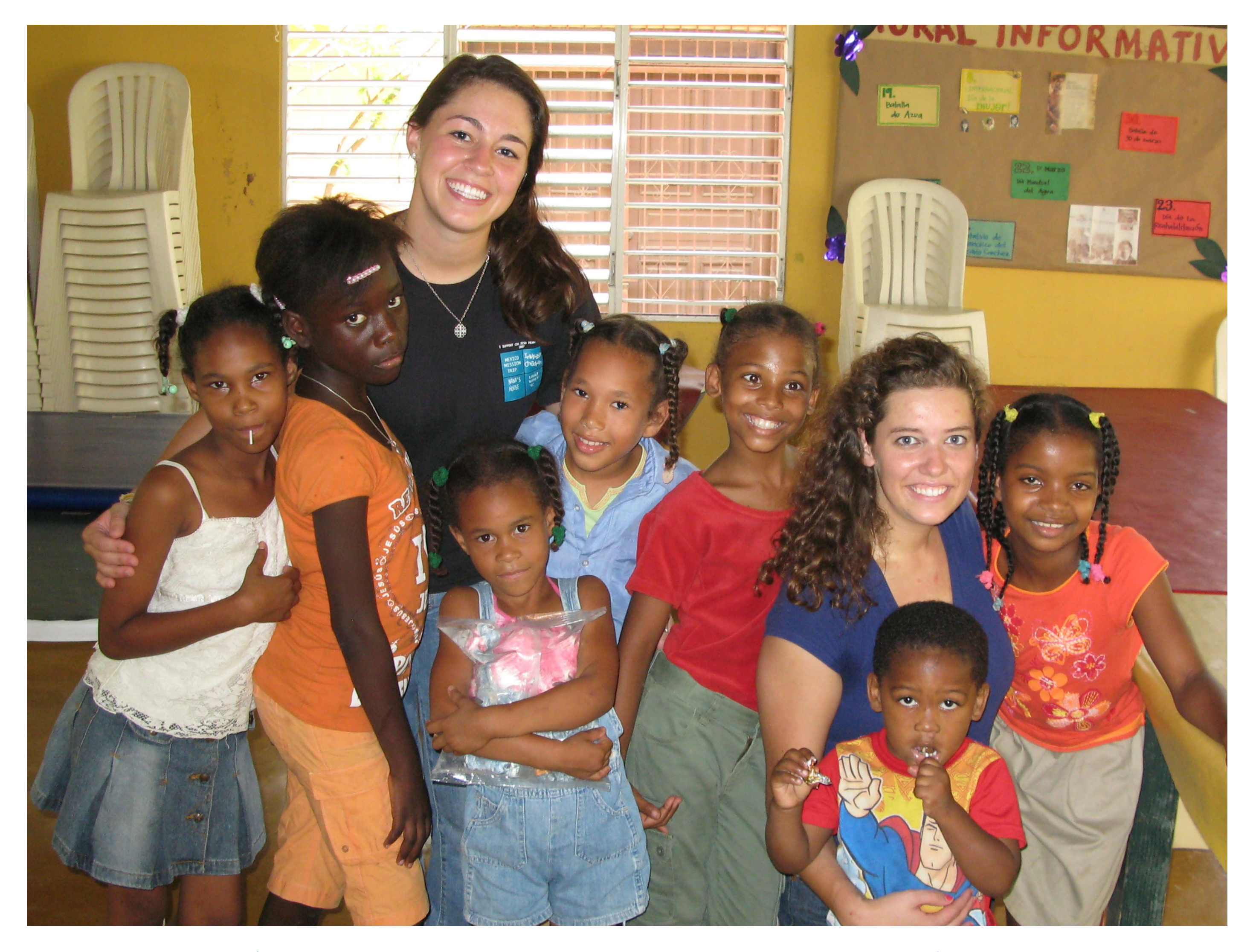
Creighton students on service sites- Cien Fuegos, Santiago (left) & Caritas (right)