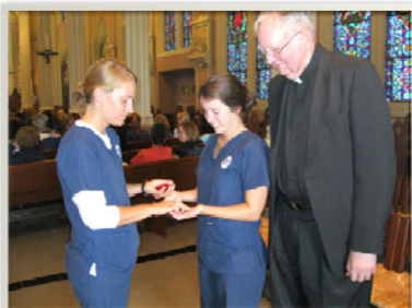
Blessing of the Hands

Students are invited to encounter God's beauty in every patient they come to know.