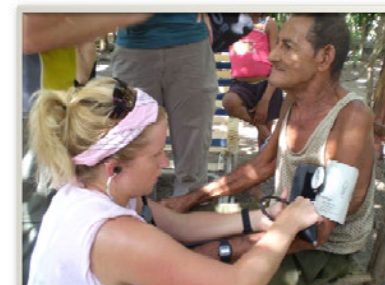
Volunteering in Dominican Republic

As a school of nursing, we serve the members of the global and local communities especially the most vulnerable.