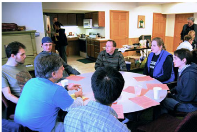
Students and Faculty participate in a reflection activity during the Departmental retreat.