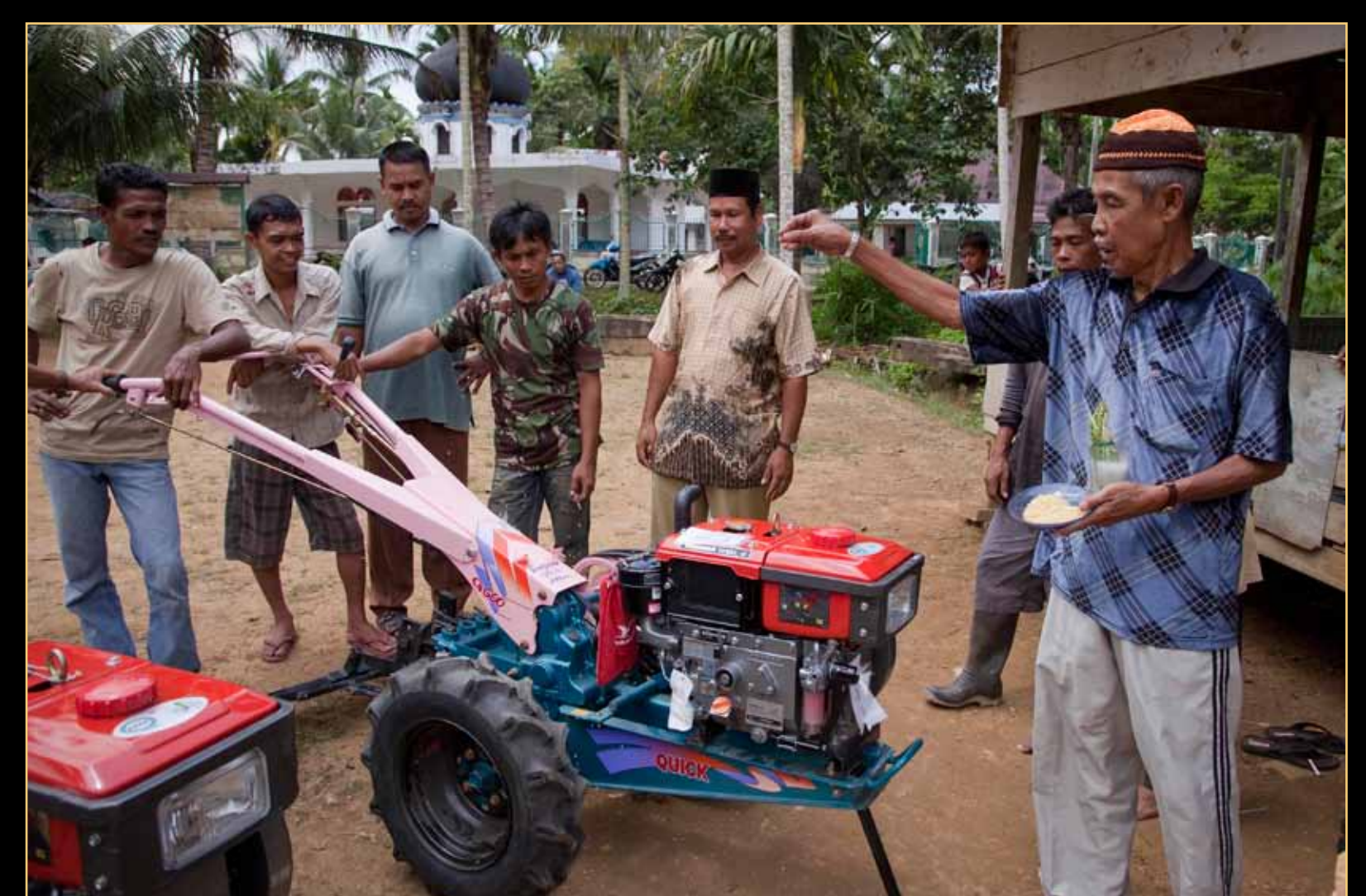
ACEH, INDONESIA — JRS supplied the tractors so the farmers of this once rebel village of Te Merah could begin rice farming. The village imam, sprinkles rice on the tractors as a blessing.