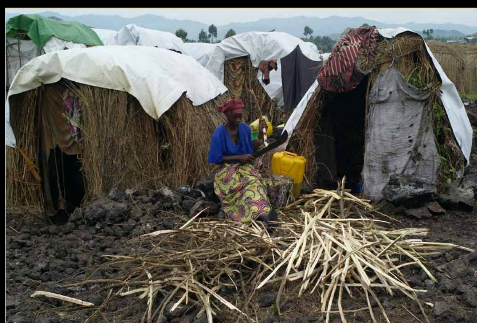
CONGO — JRS supports refugees living on a lava bed of an active volcano near Goma.