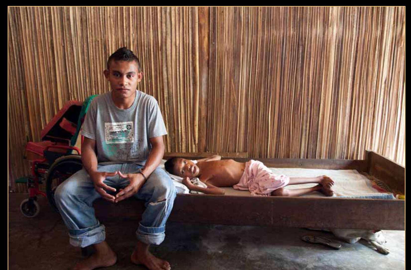
EAST TIMOR — In Dili, East Timor, JRS assists a family whose child has special needs.