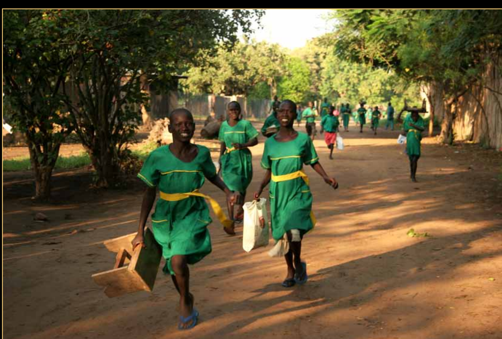
NIMULE, UGANDA — Students run to their classes after hearing the school bell in the early morning at Saint Bakhita Primary School.