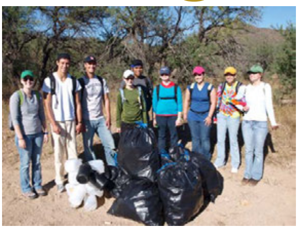
Justice Walking Crew picking up trash on the migrant trail