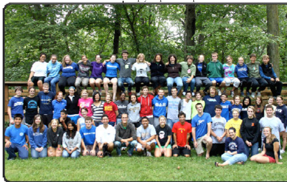
The 2010-2011 Community on our fall retreat

Coursework helps residents to process the experiences of contact and conversation with the poor and marginalized, and to build a well-grounded vocabulary to articulate their views and experiences. During the fall semester, students register in a community only section of philosophical foundations of ethics in order to further refine their understandings of personal and societal ethical responsibilities. In spring, members chose one of several small Justice and Peace Studies courses based in student-led discussion, which helps to explore deeply a specific topic.