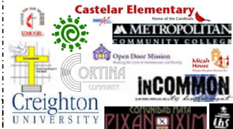
The community partners for 2010-2011